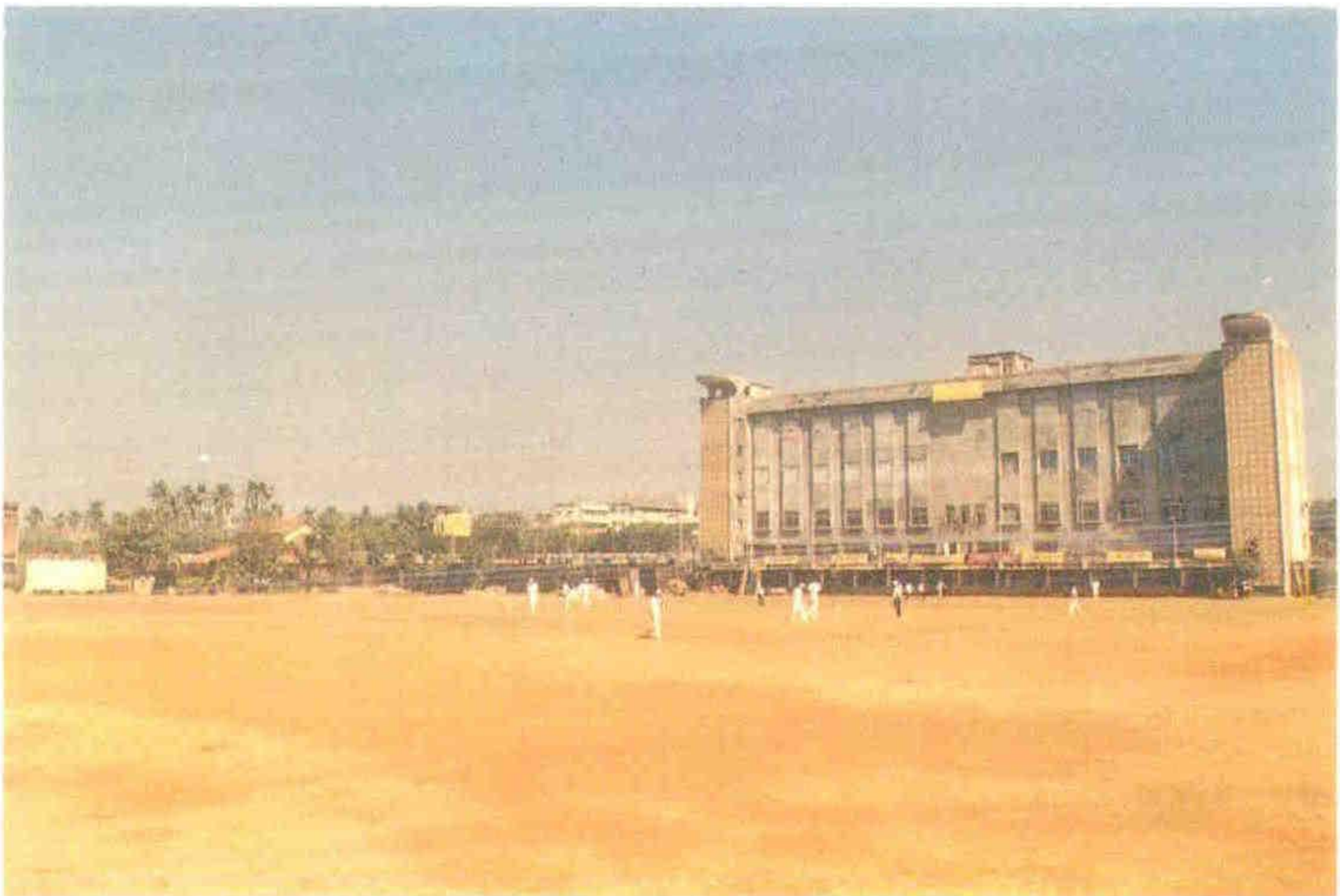
GYMKHANA AT MARINDRIVE