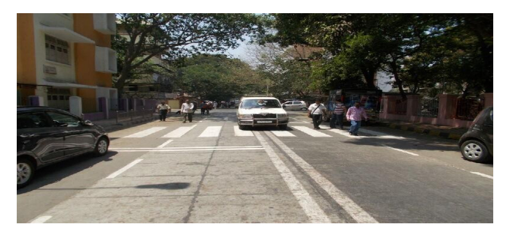
Name of work: - AC-187: Resurfacing of various roads in 'B' ward in Zone-I of City Division.