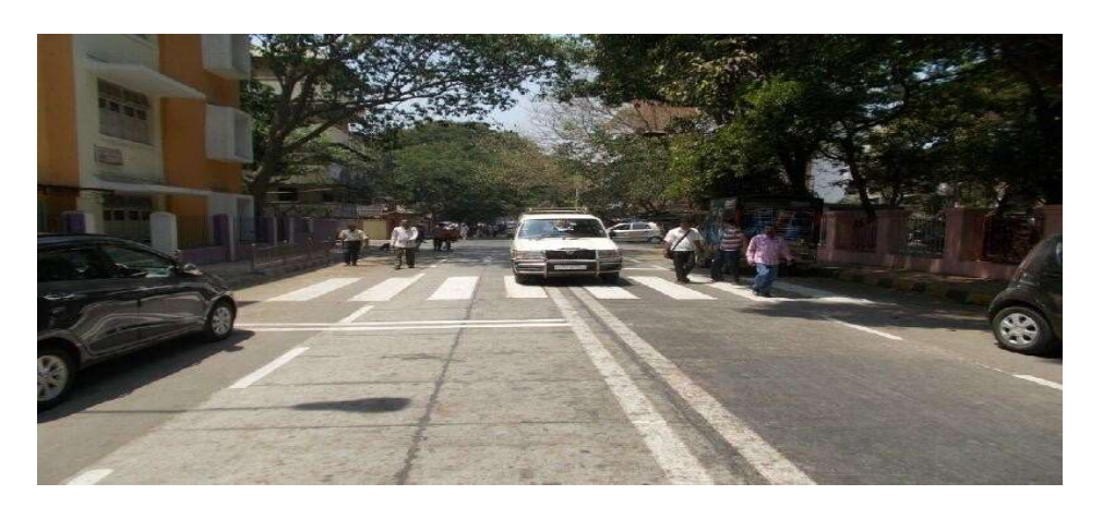
Name of work: - AC:181- Resurfacing of various roads in D Ward in Zone I of City Division