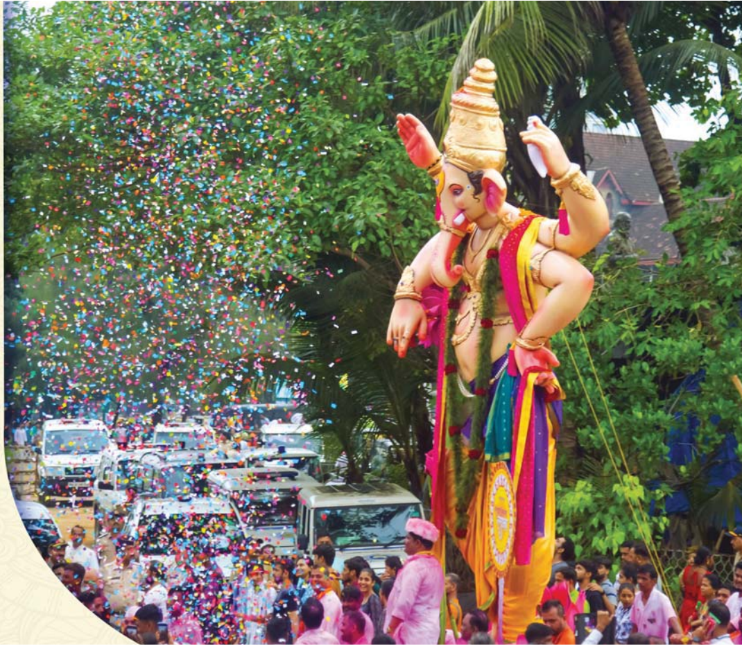
Shri Ganesh Idol Immersion Procession