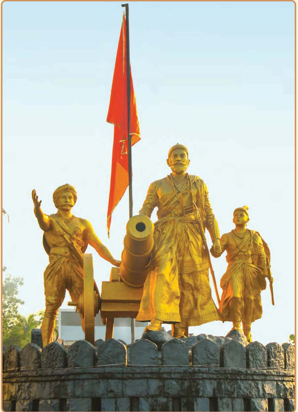
Statue of Chhatrapati Shivaji Maharaj and Sambhaji Maharaj at Juhu Chowpatty.