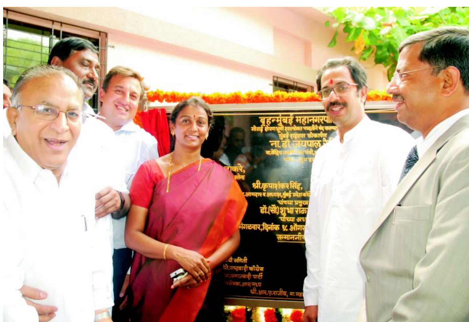
Gorai Project dedicated to Mumbai City on 18th August 2009 at the hands of Hon. Minister, MoUD, GoI, Shri Dr. Jaipal Reddy