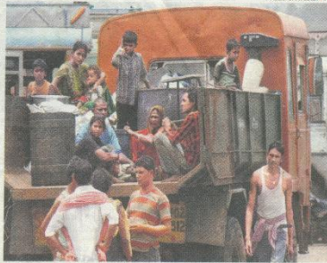
ABOUT TIME THIS WAS DONE: The slums located along and on the city's water pipelines were demolished and thus living there were forced to move out.

Despite stiff resistance from slum dwellers, the Brihanmumbai Municipal Corporation (BMC) carried out demolition of illegal structures located along the main water pipelines at various parts of the city, especially those along the water mains that provide drinking water to the city. The demolition work was done amidst tight security provided by various security agencies.